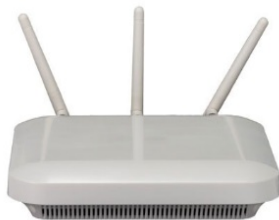
Wireless Access Point