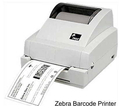
Zebra Barcode Printer

Call DMS Now at 1-888-985-2500 to Order!